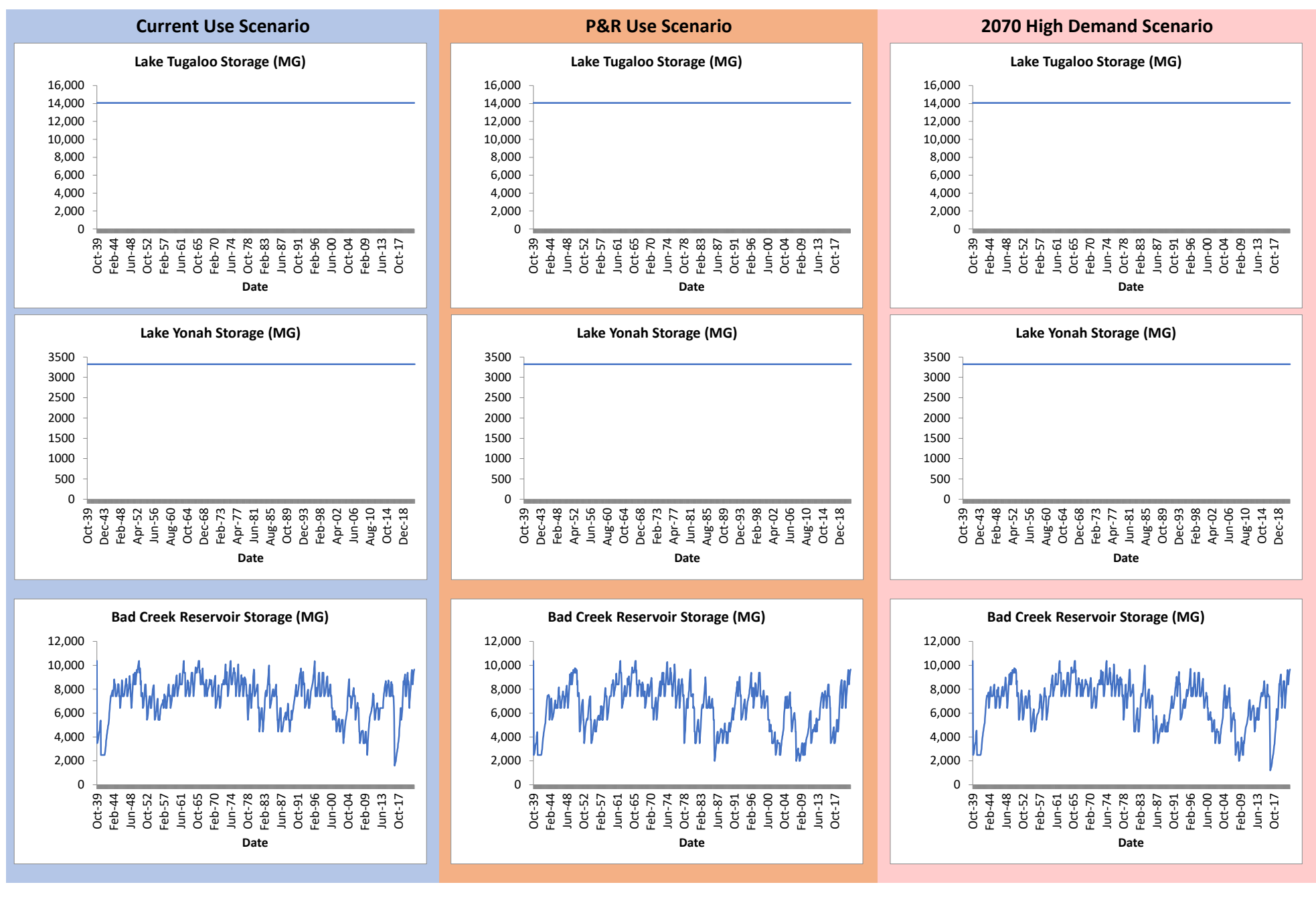
Figure 2. Reservoir Storage Plots